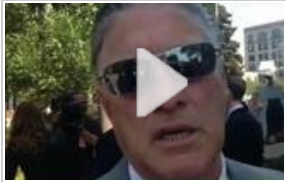
Trial onlooker is no fan of Drew