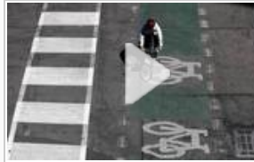
Kass: "The free ride is over, little bicycle peopl..."