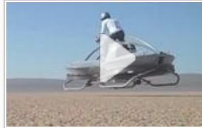
Must-see video: Flying Jedi 'hover bike'